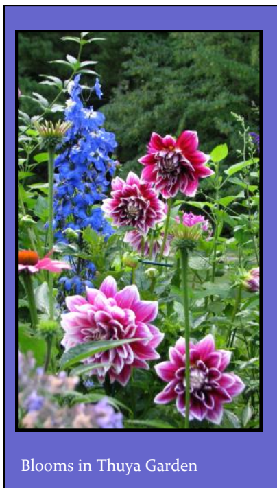
Blooms in Thuya Garden